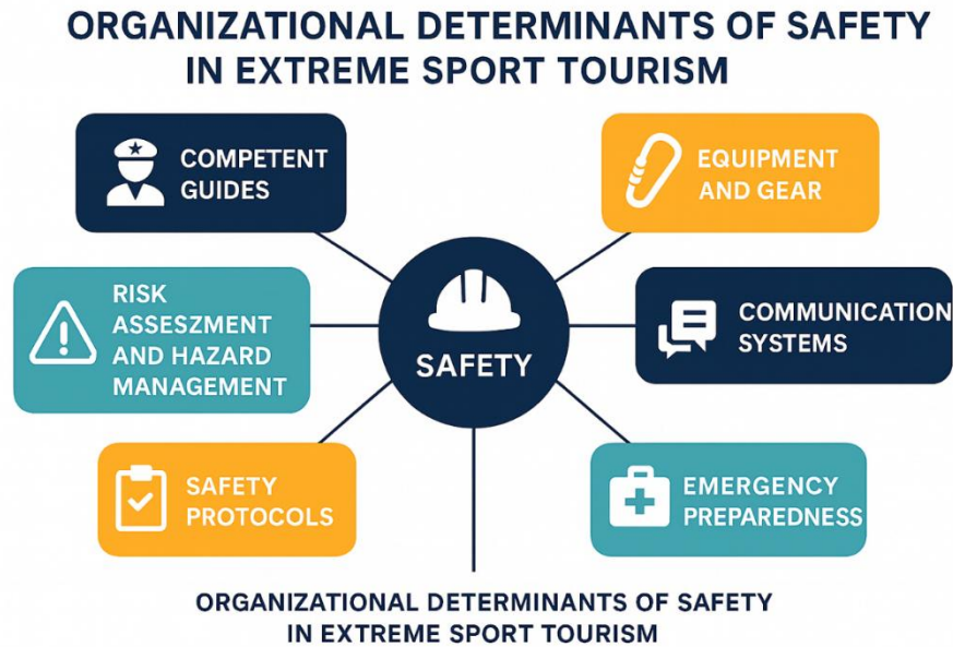
Figure 2. Organizational determinants of safety in extreme sport tourism

This figure presents a conceptual overview of the key organizational factors that determine safety outcomes in extreme sport tourism environments. At the center of the model is the concept of “Safety,” surrounded by six essential organizational components. Competent guides represent the frontline defense against accidents, as their technical skills, decision-making ability, and situational awareness directly influence participant safety. Equipment and gear quality reflect an organization’s commitment to providing reliable and certified tools, reducing the likelihood of mechanical failure in rafting, climbing, canyoning, or sky running.