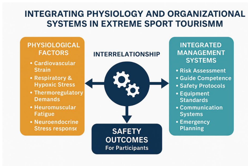
Figure 3. Conceptual model illustrating the integration between physiological factors and organizational management systems in extreme sport tourism.

Integrated framework combining physiological and organizational safety determinants, highlighting how physical stressors and management systems interact to produce safe or unsafe outcomes in adventure tourism contexts (Table 3).