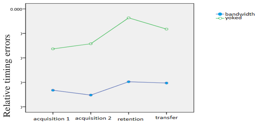
Fig 1. Mean relative timing error for all test blocks as a function of display for the two groups