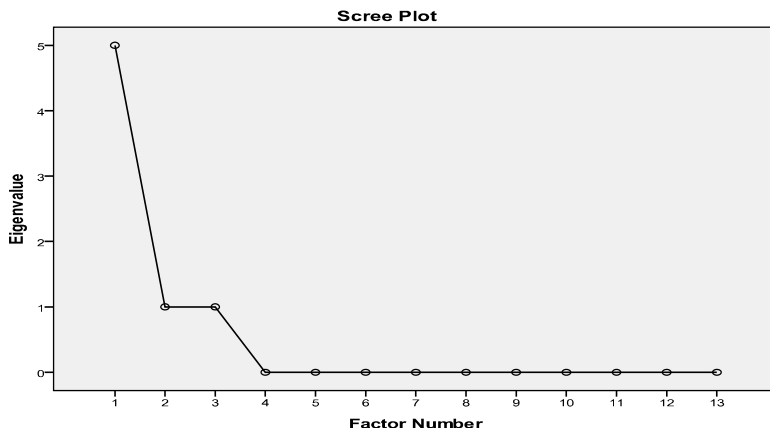
Figure 1: Scree Plot for the factor solution

The slope of the scree-plot changes from steep to shallow after the first three factors (Figure 1). This also suggests that a three-factor solution can be the right choice.