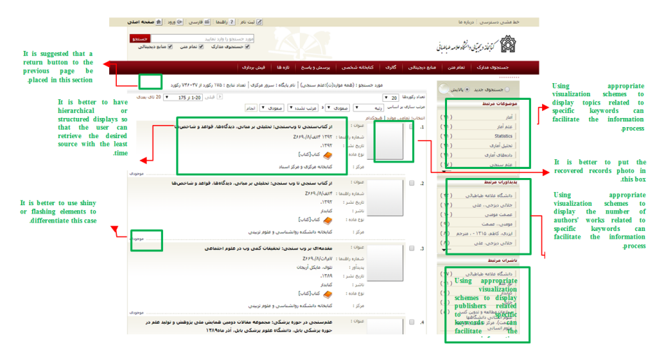
Figure 6- The proposed pattern of findings page of the Digital Library of Allameh Tabataba'i University

Since visualization provides the user with a faster understanding of the volume of information and allows him to access a certain volume of data with the way he or she is displayed according to his or her perceptions, the positive effect of visualization on the user experience and the quality of his performance in the digital library to access the required resources is not covered and is an influential factor in the user's information behavior.