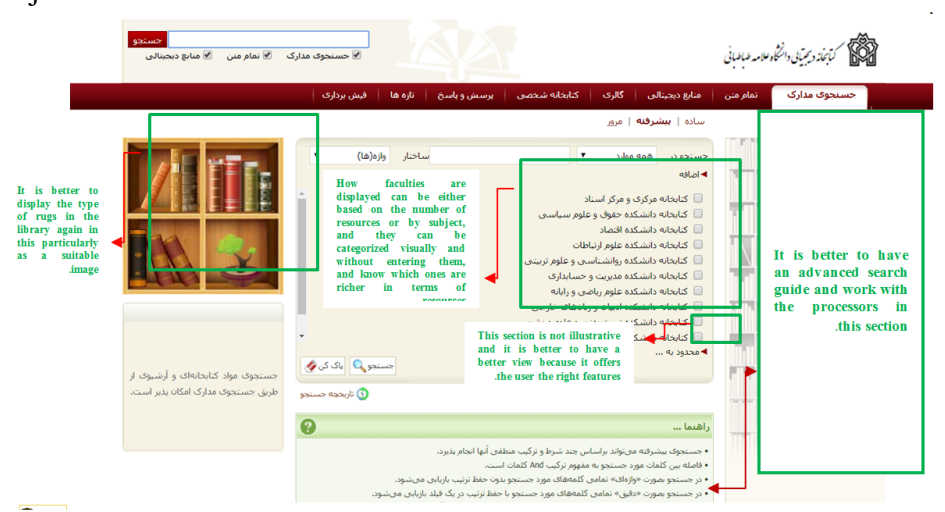
Figure 5- The proposed pattern of the digital library search page of Allameh Tabataba'i University

considered to place the guiding or guide elements so that the user can quickly and easily access the desired sections. They have this section, but they have forgotten which part it is located, to have a reminder, and for those who do not need to study this reminder, it can be rejected.