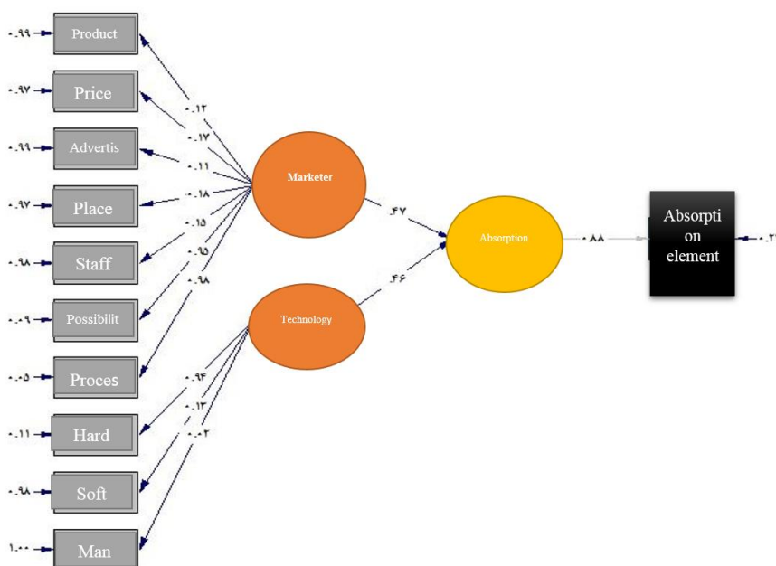
Figure 1. Model for predicting customer attraction through integrated elements of marketing and application of new information and communication technology in sports venues

According to Table (1), among the components of the marketing