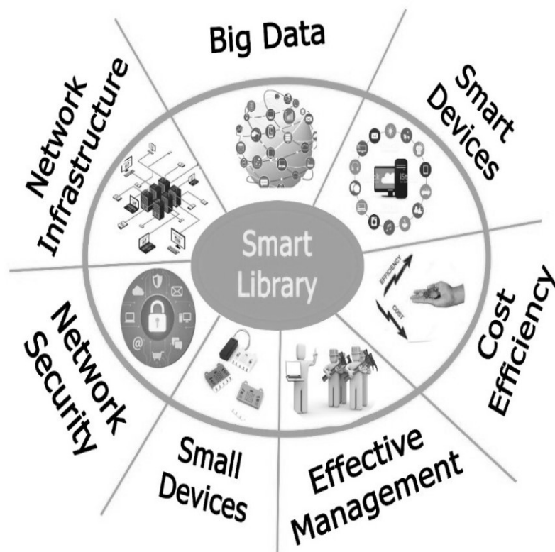
Fig.1. Different components in a smart library

Clearly, IOT could lead to dramatic changes in library services as soon as possible. It is important to understand the capabilities, uses, and even risks of these items. Libraries often play as translators of new information concepts and technology. They should provide resources to help them understand the mean of the IOT. Libraries must be aware of the potential of IOT to disrupt services and alert patrons to potential vulnerabilities when using their networks, their hardware and software (Massi, 2015). Different components in a smart library have been shown in fig.2.