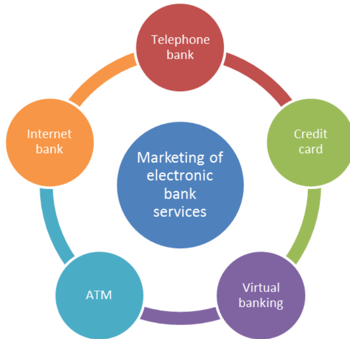
Figure 1. Marketing of electronic banking services

The marketing of electronic banking services includes three basic pillars which once established correctly, they will revolutionize the country's banking services (Khosravian, 2021). Electronic marketing is the use of electronic channels to communicate with customers to publish marketing messages. This type of marketing tries to attract the audience to the organization by using its special tools and achieving the ultimate goal of marketing (making a profit). On the other hand, in the current competitive situation, banks can take advantage of the special value of their brand to maintain and improve their position against other banks and to influence the way their customers choose some services over some other services.